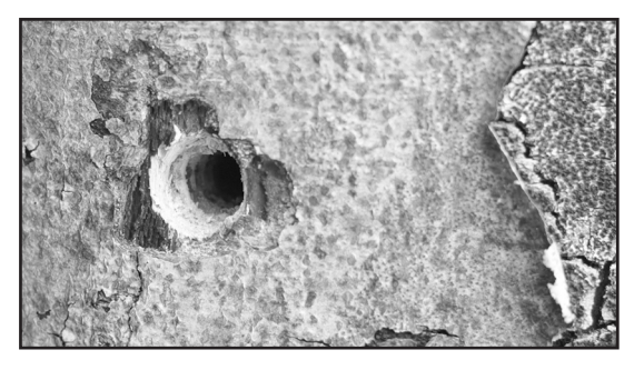
Step #1 Select your hardware and follow the manufacturer's application procedure for proper pre-drilling procedure and placement. The hardware shown below is an eye-lag screw and requires a pilot hole of 1/16" to 1/8" smaller than the diameter of the screw.

Be sure to read and completely understand this procedure before applying product. Be sure to select the proper PREFORMED™ product before application.